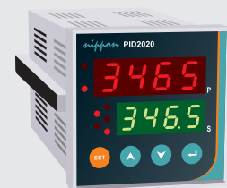
NIPPON PID 2020